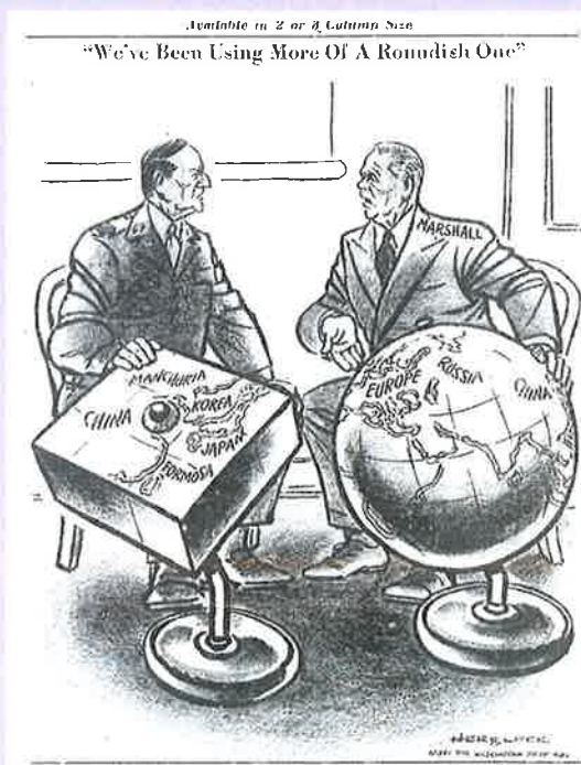
▶ This American cartoon by Herblock appeared in the Washington Post newspaper in 1951.