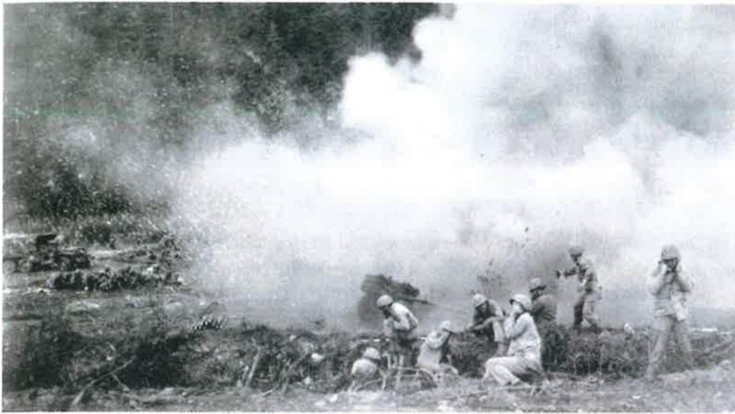
▶ A shell explodes among U.S. troops during a Korean War engagement.